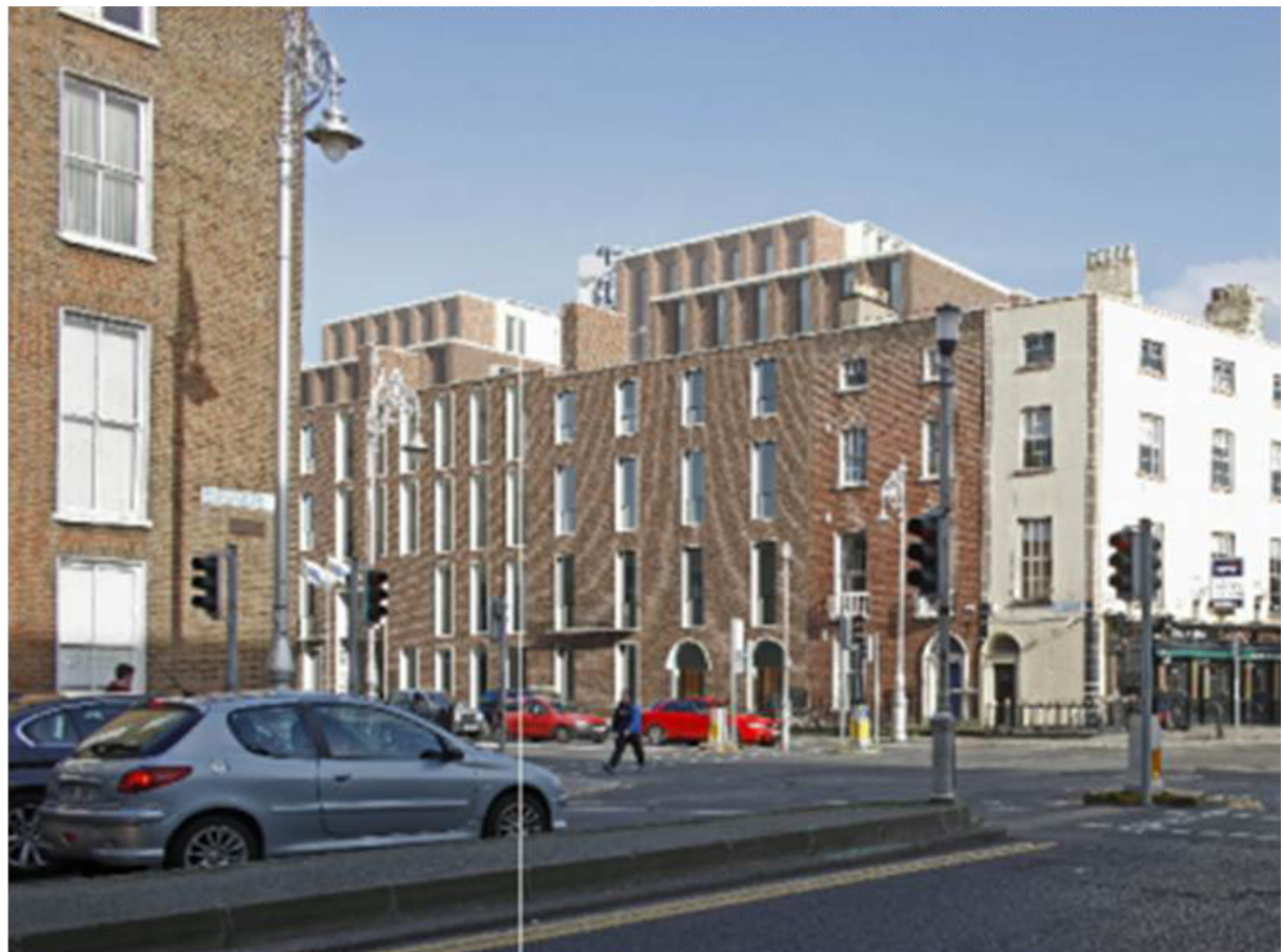
Below: The Society made an observation to Dublin City Council on the ESB's proposed re-development of its Fitzwilliam Street headquarters.