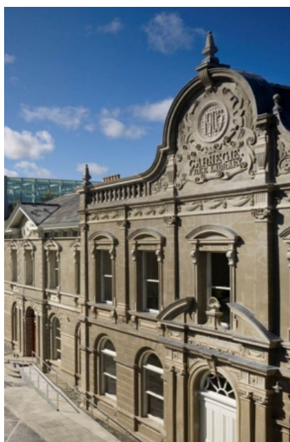
Joint winner: Senior College, Dun Laoire

The scope and excellence of the external work undertaken was of particular interest. The works included the restoration of the stonework, roofs, windows and stained glass, as well as the clock. The project also included a clever internal reorganisation of the spaces, which opened up the building to the public and enhanced and expanded the landmark status of this historic building.