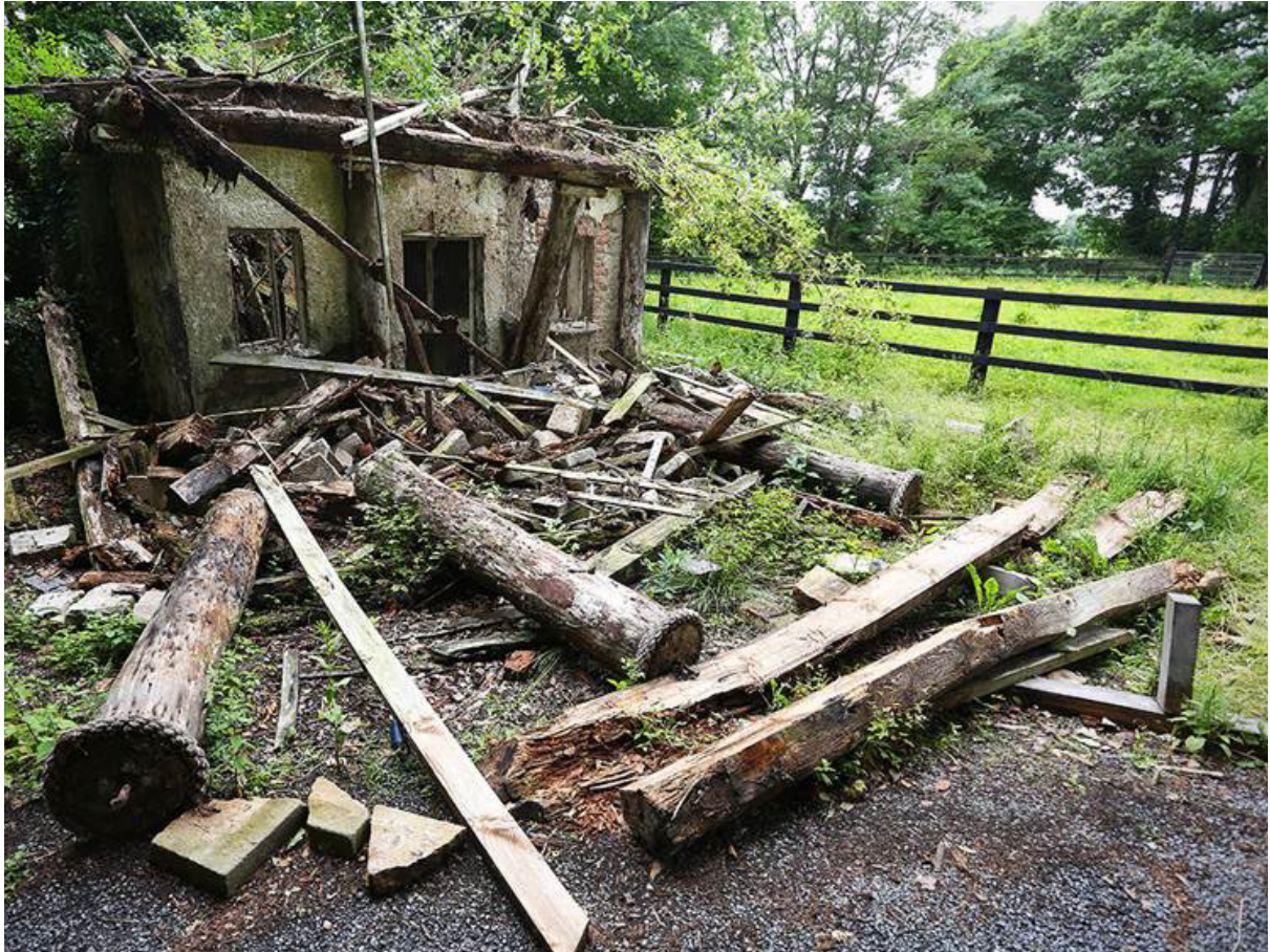
Above: The Society campaigned to preserve the internationally-important rustic timber lodge at Belline, Co. Kilkenny. Despite legal proceedings, the lodge was allowed to collapse.