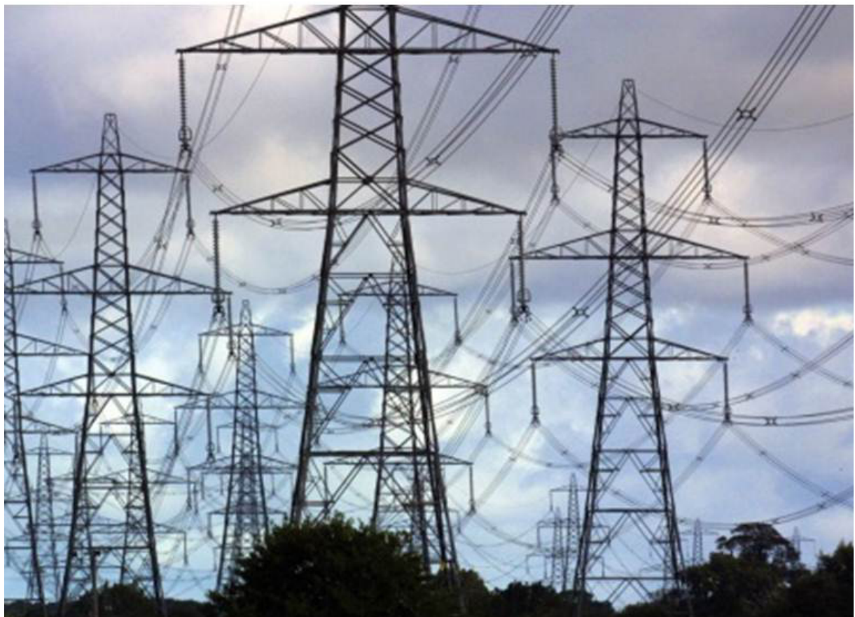
Below: The Society criticised Eirgrid proposals to erect pylons in areas in or close to historically-important landscapes and houses.