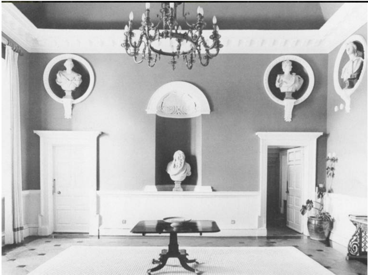
Above: The Society lobbied for the re-instatement of the busts at Bellamont Forest, Co. Cavan.