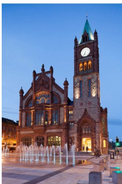
Joint winner: The Guildhall, Derry

In 2014, there were joint winners of the Conservation Award and two projects highly commended. Submissions for the Original Drawing Award were also of a very high calibre with a commendation awarded in addition to the winning entry.