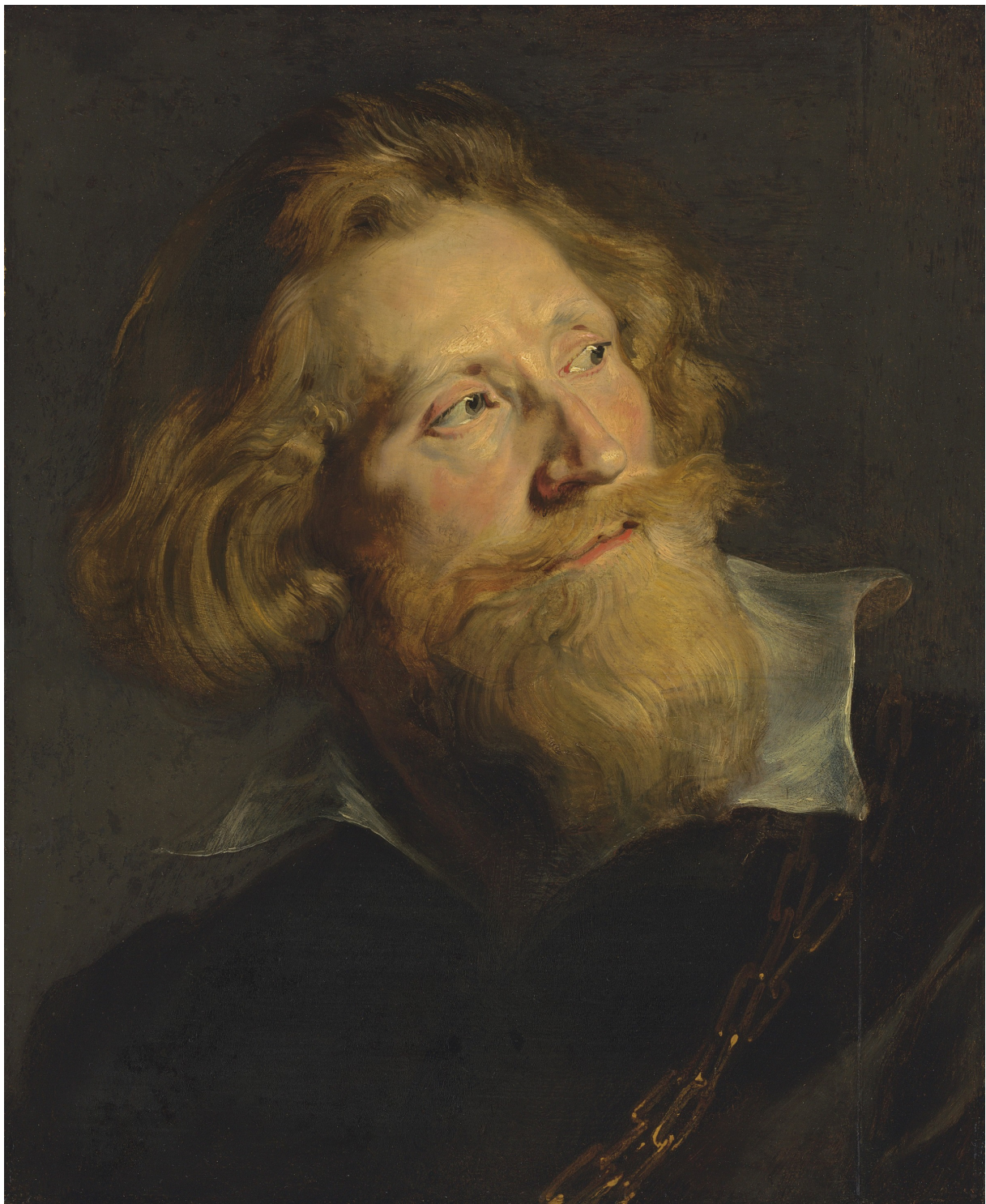
Above: Portrait of a bearded man, by Sir Peter Paul Rubens

The Society joined other heritage, cultural and arts organisations to vigorously oppose the proposed sale of several master pieces from the Beit collection at Russborough, Co. Wicklow. After an intense campaign, the paintings were withdrawn from the sale, some of which were purchased by individuals and given to the National Gallery of Ireland. The Society worked hard to encourage the government and other bodies to engage with the Alfred Beit Foundation to address the funding shortfall that Russborough faces.