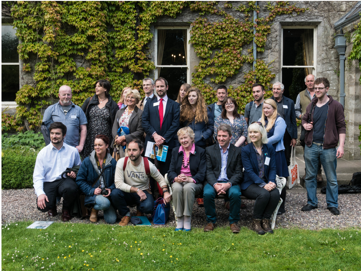
Some of the attendees at the Conservation Without Frontiers Summer School at Castle Leslie