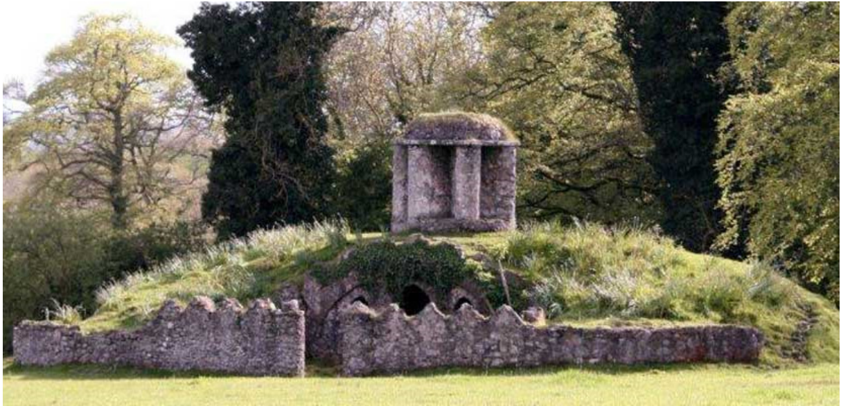
Above: The Foxes Earth, Larchill Arcadian Gardens, Co. Kildare.

The Society opposed the construction of a road adjacent to Larchill Arcadian gardens, in Co. Kildare, proposed by a nearby composting facility, which would have detrimentally affected views from the gardens. Unfortunately, permission was granted to construct the road.