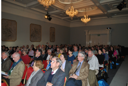
Attendees in George's Hall, Dublin Castle

The Art in the Country House conference coincided with the Art Institute of Chicago's exhibition Ireland: Crossroads of Art and Design and traced the cycle of the acquisition and dispersal of great collections in Ireland, while also exploring the lively intersection of art and the country house in the present day. The following presentations were delivered by leading scholars from Ireland, Britain and the USA.