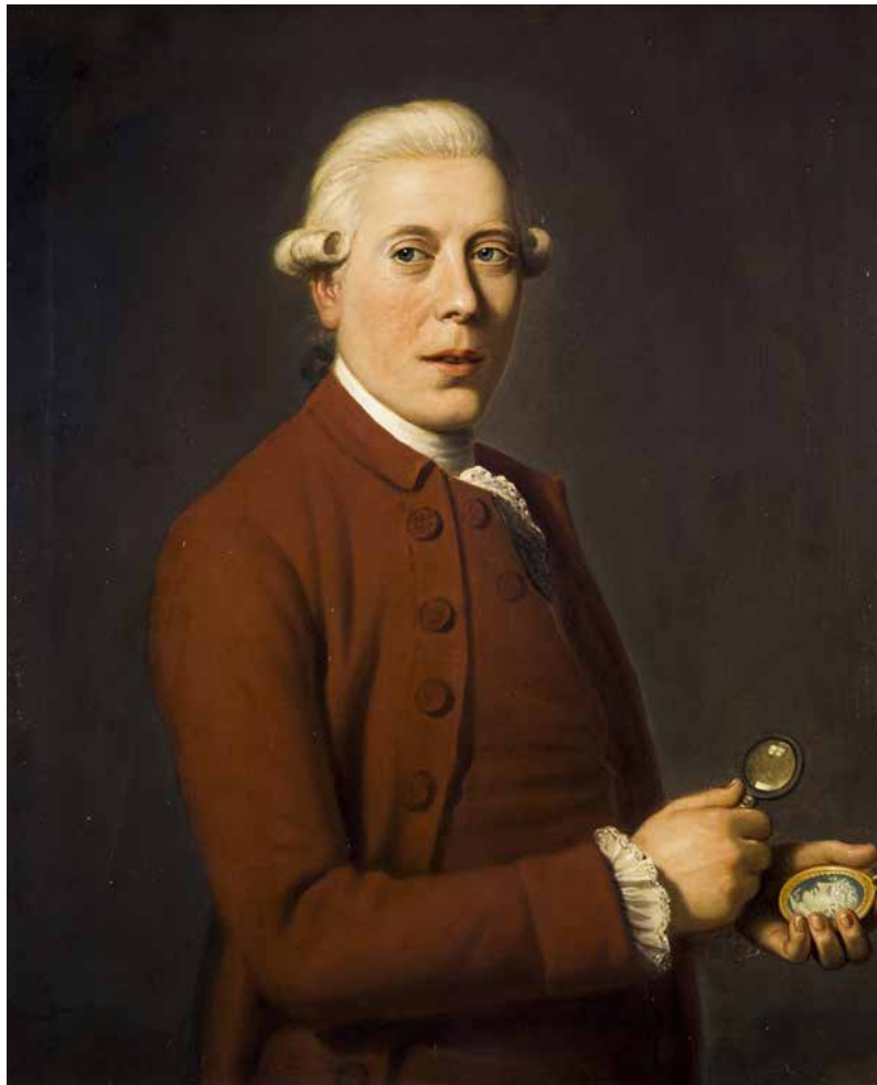
David Allan, James Tassie , 1781, Scottish National Portrait Gallery.