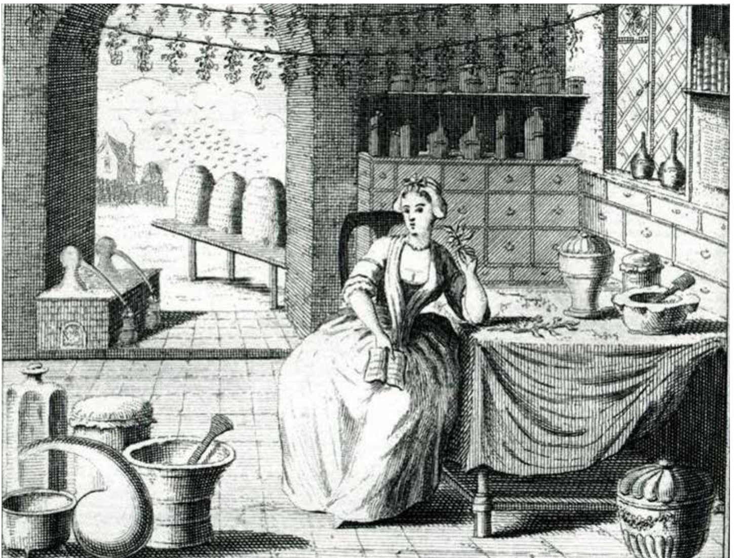
Housekeeper in her Still-Room taken from the frontispiece of Nathan Bailey's Dictionarium Domesticum (1736).

The early modern home was a complex space, through which people, things, materials and knowledge circulated. Masters and servants alike, exercised a wide range of technical competencies and material literacies in the activities they conducted at home – using minds and hands to achieve work of both a necessary and of a more exploratory nature. Here, the study of domestic practice is proposed as a productive approach to understanding the nature of enquiry in eighteenth-century society. This approach also helps us to see who engaged in intellectual life in this period, in terms of both gender and social status. Since our intellectual histories abandoned narratives that privileged the 'great men of science' and their 'discoveries' to the exclusion of other actors and social contexts, scholars in a range of disciplines have identified materials, spaces and marginalised people as being critical to the production of knowledge in this period. Whilst these studies have influenced this research in important ways, what is presented here takes a different approach. Instead of looking to materials, spaces and actors to get to the question of knowledge production, this research argues instead that the practice of intellectual enquiry was just one of many domestic practices and that the relationship between domestic labour and intellectual work was enmeshed.