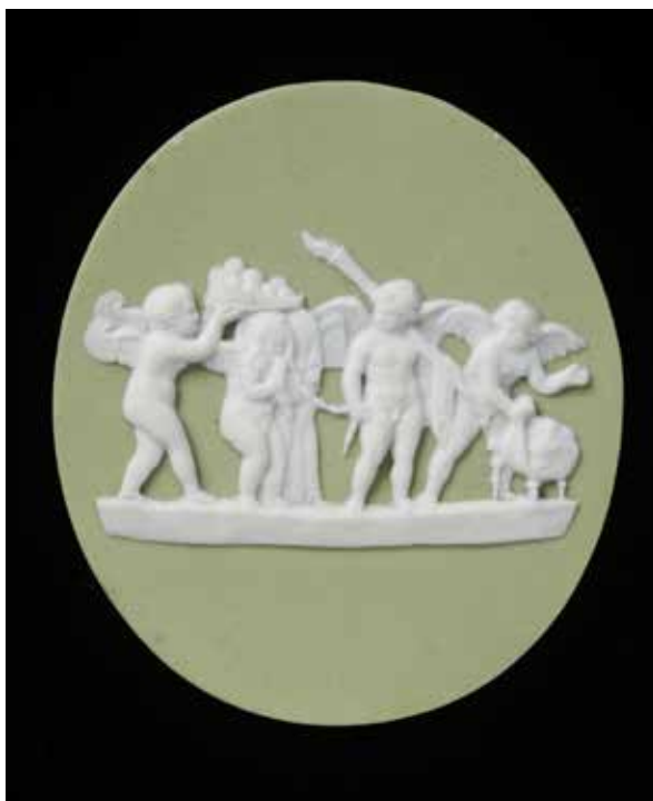
Josiah Wedgwood, Marriage of Cupid and Psyche, white jasperware with green dip with applied bas-relief in white, Staffordshire, c. 1790–1800